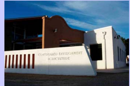
CEA Building & Greenhouses