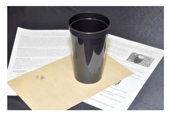
Step 2: Assemble the trap

Locate a black jar, cup, or container. You can paint it or use black tape. You'll only need two to three rabbit pellets and one sheet of seed germination paper per trap.