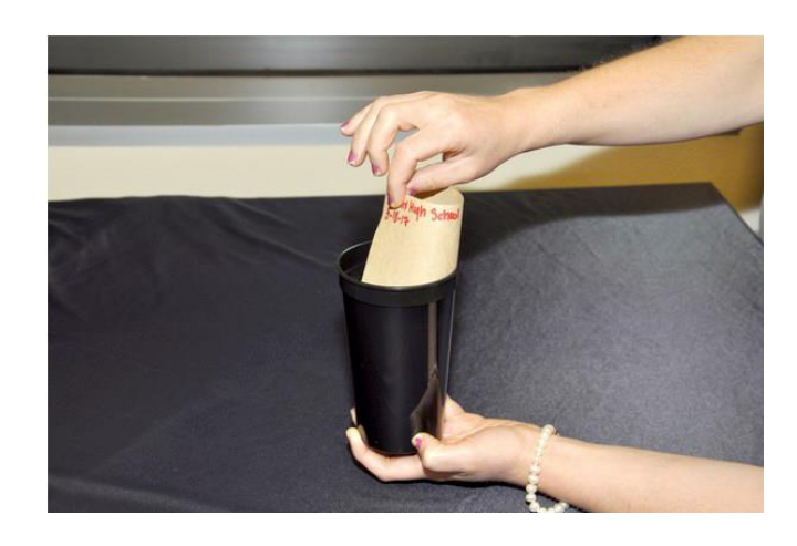
Step 3: Activate the trap Drop in two to three pieces of rabbit food. This acts as bait. Then just add water!