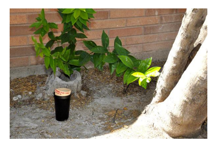
Step 5: Collect the eggs

Let it sit for one week. Use additional seed germination paper and rabbit pellets to place additional traps over several weeks or trap in several locations.