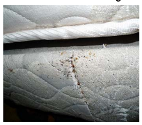
Dark spots on your bed.