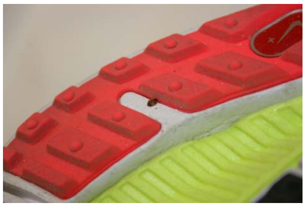
A bed bug hitching a ride on the sole of a shoe.