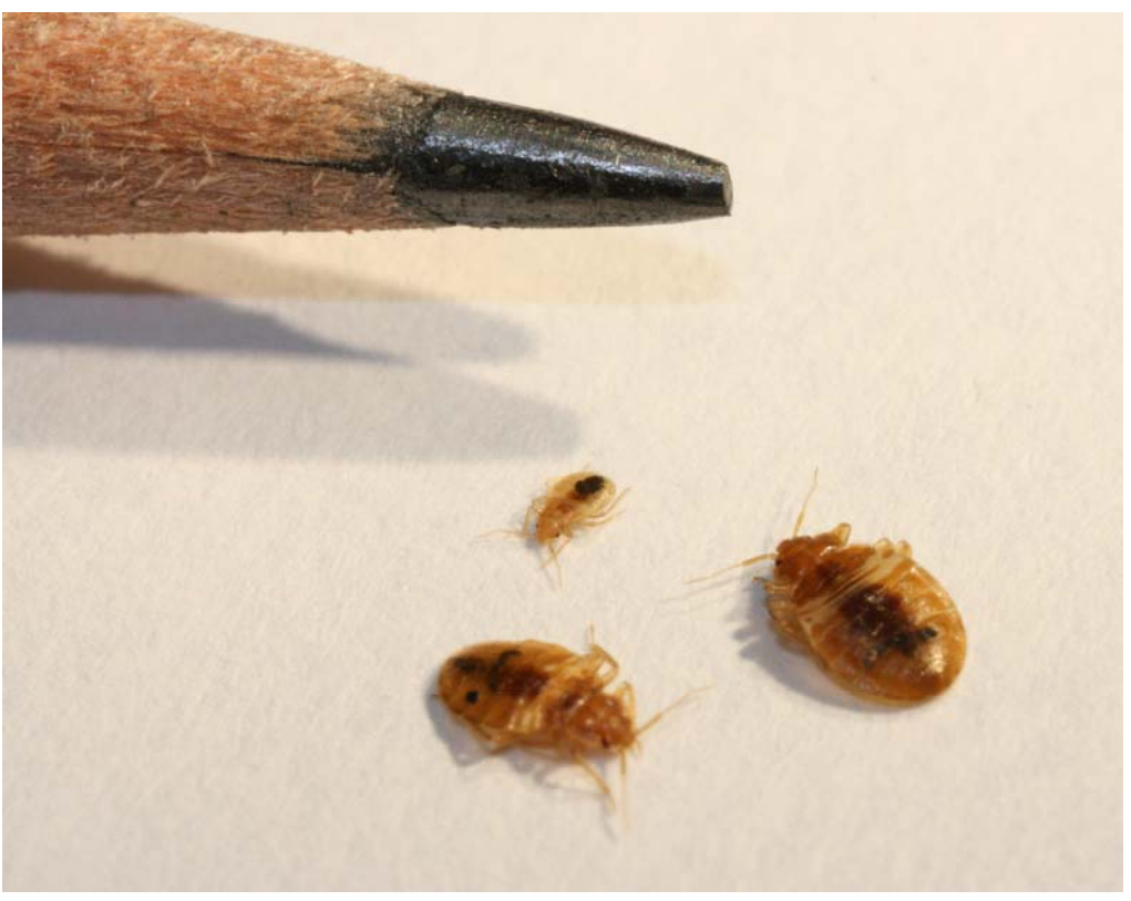
Bed bugs next to a pencil point for scale.