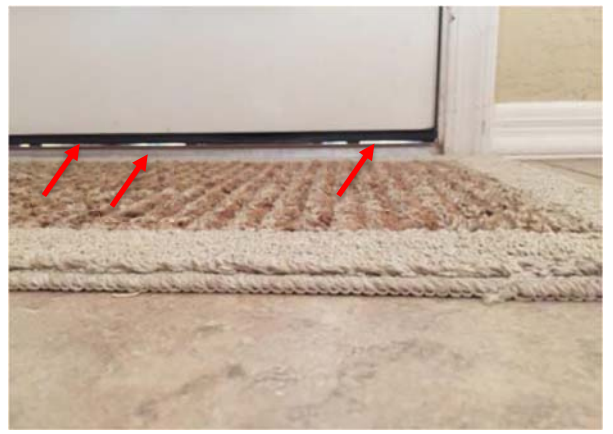
This locked door is wide open to pests! See light coming in through gaps under door.

A better use of your hard-earned money would be to pest-proof the doorway. Pest management professionals can advise you on pest-proofing your home. If your service provider declines to help with this, get a different one. Some companies