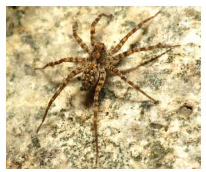
Wolf spider

Spiders: Several outdoor spiders, such as wolf spiders, may wander indoors or closer to buildings in the fall in search of prey because many of their normal prey insect populations outdoors start declining.