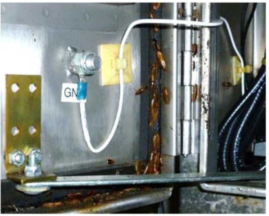
German cockroaches inside equipment

Generally, cockroaches are active by night and spend the daytime hiding. Sightings during the day may be indicative of significant