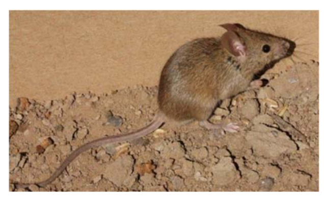
House mouse