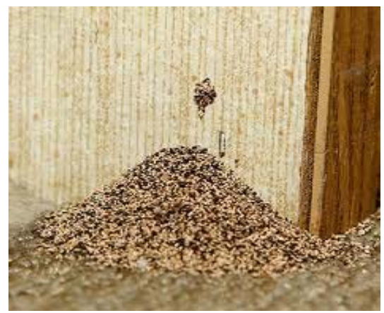
Sign of western drywood termite damage