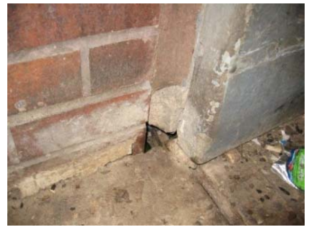
Gaps or holes in walls or foundations provide entryways to rats.

Rodents: Many commensal rodents, such as house mice and roof rats, will migrate indoors as the weather cools in search of warmth, shelter, food, and water. They will thrive in various suitable, undisturbed locations which have available food sources nearby. Because house mice are so small, they can gain entry into homes and other buildings much more easily than rats. House mouse infestations are probably 10 to 20 times more common than rat infestations.