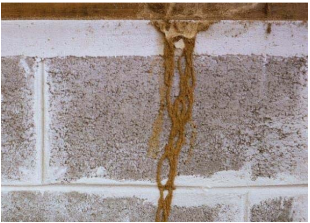
Subterranean termite-working tubes