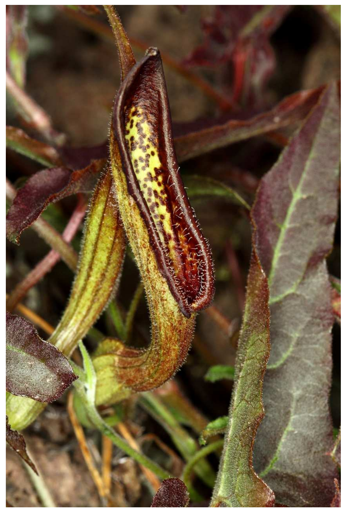
Figure 3. Aristolochia watsonii. Near Cliff, New Mexico, 19 Apr 2010.