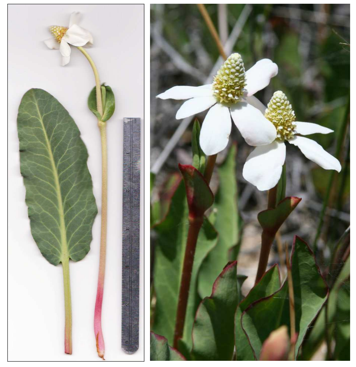
Figure 6. Anemopsis californica , at Quitobaquito; photos by Sue Rutman. A. Leaf and flowing stem with a reduced leaf and inflorescence, 3 May 2008. B. Inflorescences, 5 May 2008.

Semi-saline and alkaline soils of wetlands in southwestern USA and northwestern Mexico.