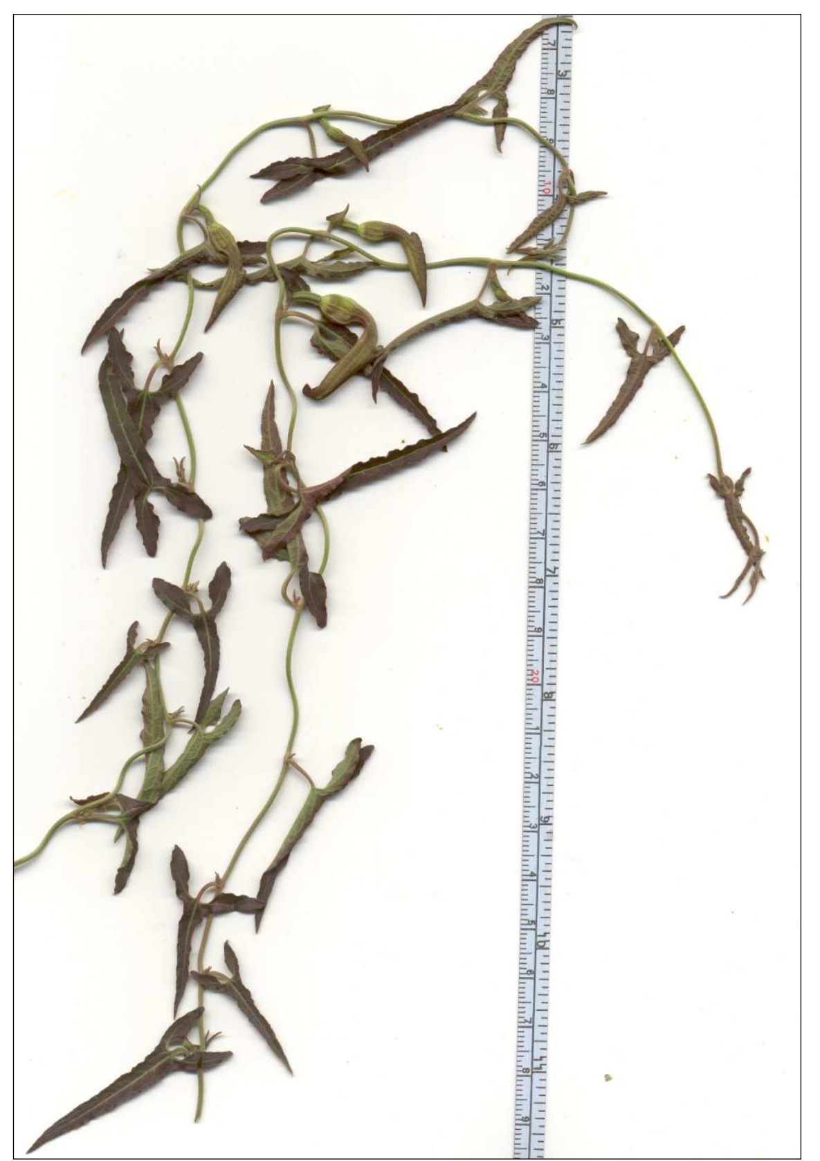
Figure 2. Aristolochia watsonii. Hwy 85 near Organ Pipe CNM visitor center, 28 Aug 2008.