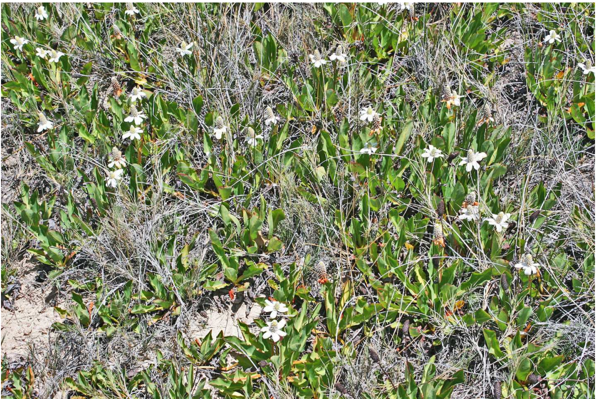
Figure 5. Anemopsis californica, at Quitobaquito, growing with Distichlis spicata, 5 May 2008.

The Saururaceae includes 4 genera and 6 species of herbaceous perennials native to Asia and North America. These plants are characterized in part by tannin and ethereal oil cells in the parenchyma tissue, which may account for the long and varied medicinal uses. Anemopsis is monotypic.