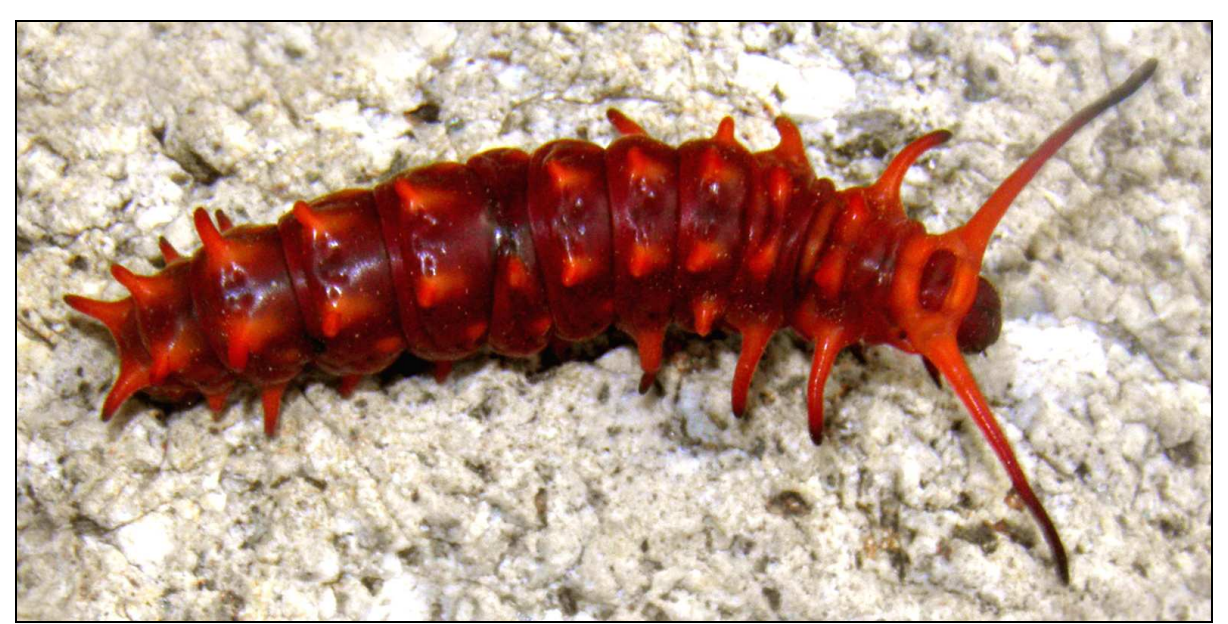
Figure 4. Battus philenor caterpillar. Near Yocogigua, Sonora, Mexico, 14 September 2012.

Caterpillars of the pipevine swallowtail butterfly ( Battus philenor , Fig. 4) feed on Aristolochia , including A. watsonii . These caterpillars sequester aristolochic acid from the plants, which renders the larvae as well as the butterflies toxic to birds.