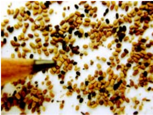
Drywood Termite Fecal Pellets