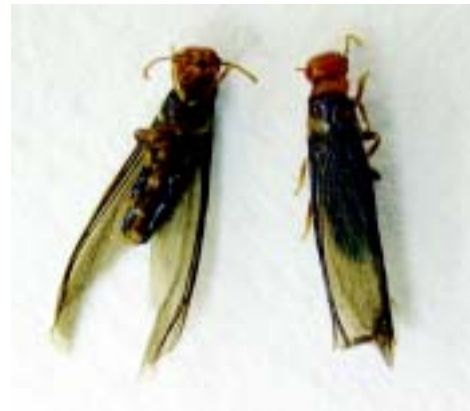
Alates or Swarmers

The reproductives are winged (alates or swarmers) or wingless males and females that produce offspring. The primary reproductives, also called swarmers or alates, vary in body color from dark brown to light yellowish tan. Their wings may be almost clear to smoke gray, and have few distinct veins in them. Swarmer drywood termites are about 7/16 inch (11mm) long, including the wings. If the primary reproductives die, they are replaced by immatures that can become capable of