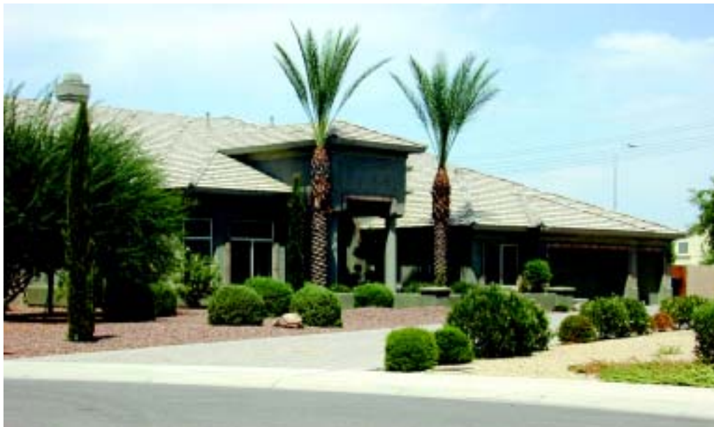
Modern homes are often constructed with fewer entry points and less exposed wood

Check the foundation carefully. Examine any wood access doors, doorframes or vents. Probe, sound and examine sills and floor joists, particularly at the perimeter of the building. Look for accumulations of fecal pellets on sill tops. Examine wooden floors closely, especially subflooring and the floor joists below it, for additional damage.