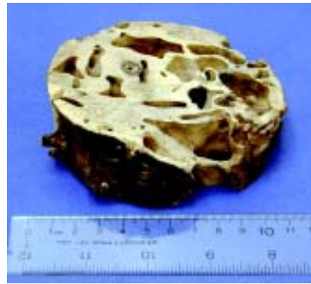
Drywood Termite Tunneling Activity

Control measures include reducing the potential for drywood termite infestations, preventing termite entry, removal of infested wood and applying chemicals, or using other techniques for remedial treatment. (See Table)