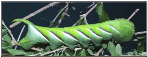
Bruce Walsh, University of Arizona