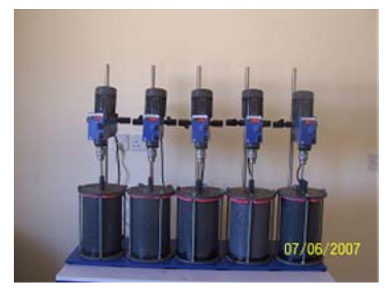
Figure 1. first set of reactors operated at five Different mixing velocities and at 60d of SRT