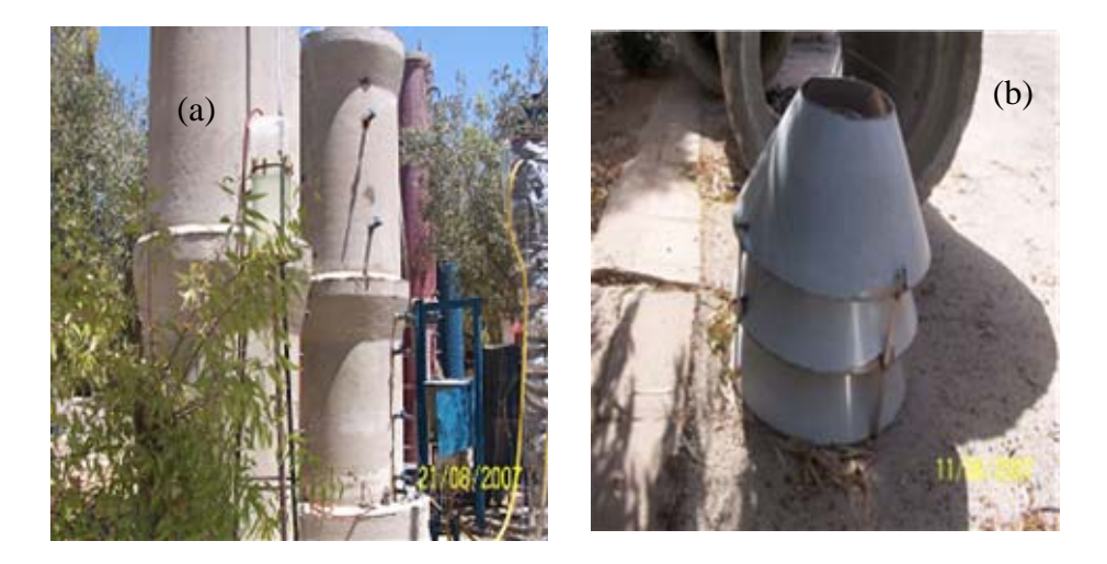
Figure 3. Two UASB reactors (a) with GLS layers (b) installed at the location of Abu-Busier wastewater treatment plant.

These values are much lower compared with 58-70% reported for domestic sewage in Jordan (Halalsheh, 2002). Soluble fraction of the COD represents 50% and 43% of the total COD as calculated for winter and summer respectively, which can be considered as a considerable fraction compared with domestic sewage.