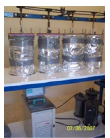
Figure 2. First set operated at 25°C and different SRTs

C. Effect of Lamella plates on sludge concentration in conventional UASB reactors operated at ambient temperatures in Jordan