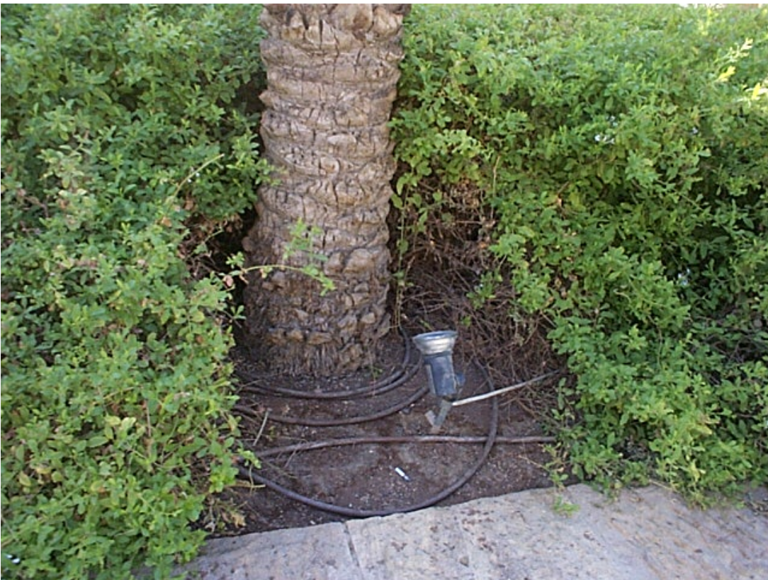
Figure 3. Tubing wrapped around a palm tree.