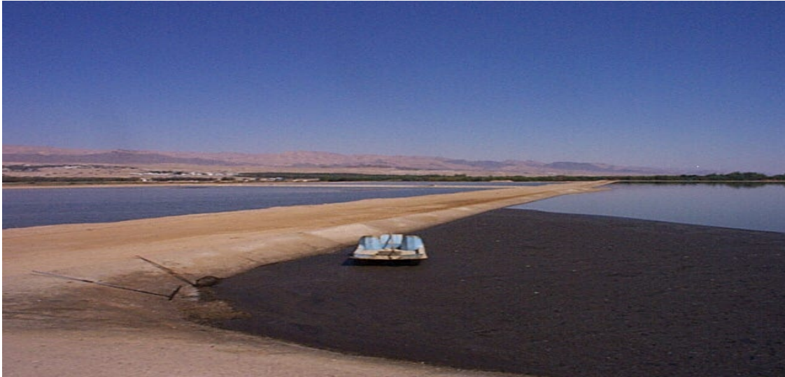
Figure 14. Maturation ponds in Aqaba.

The wastewater treatment plant is a completely passive system with two facultative ponds (Figure 13) and two maturation ponds in parallel (Figure 14). Both ponds are 9 m deep. There is a 17-day design detention time; however, the ponds are currently overloaded. The flow rate into the wastewater treatment plant is 9,000 m 3 /day. The loss to seepage and ET is 1,500 m 3 /day. Approximately 1/3 of the wastewater irrigates a date palm farm. The farm treats the wastewater before application to the palm trees.