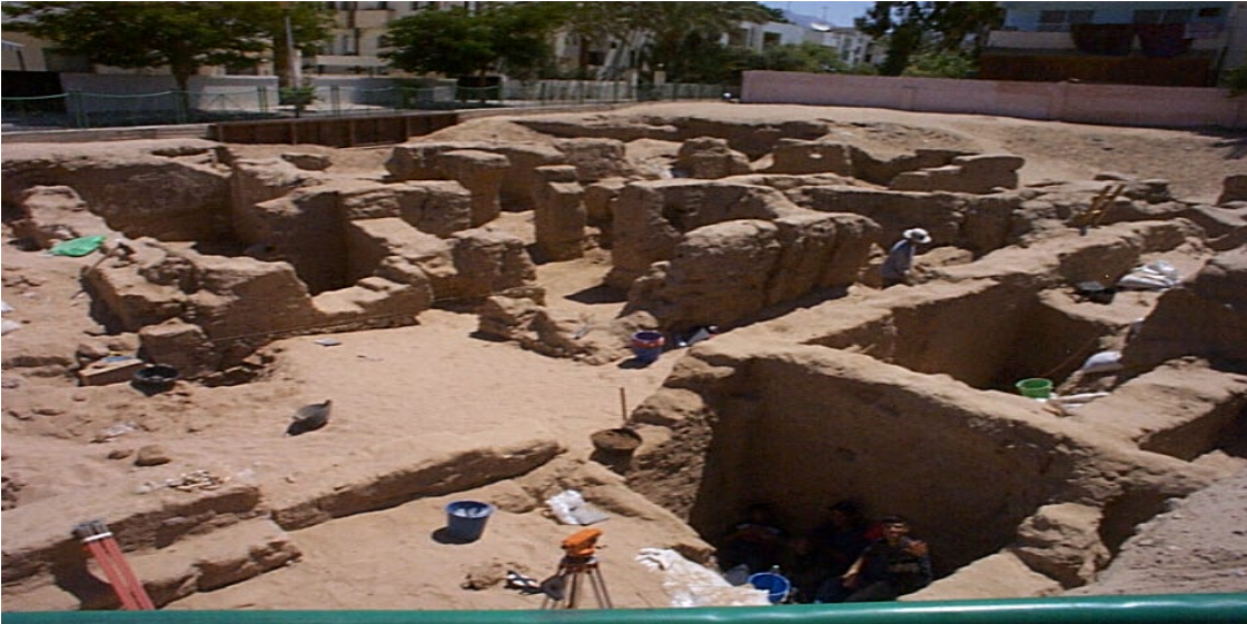
Figure 20. North side excavation (not part of demonstration garden).