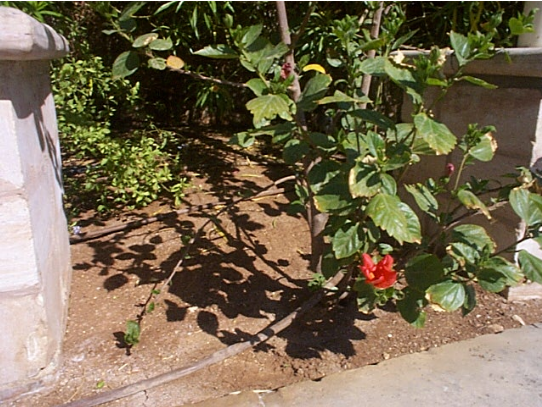
Figure 2. Salt buildup around emitters.