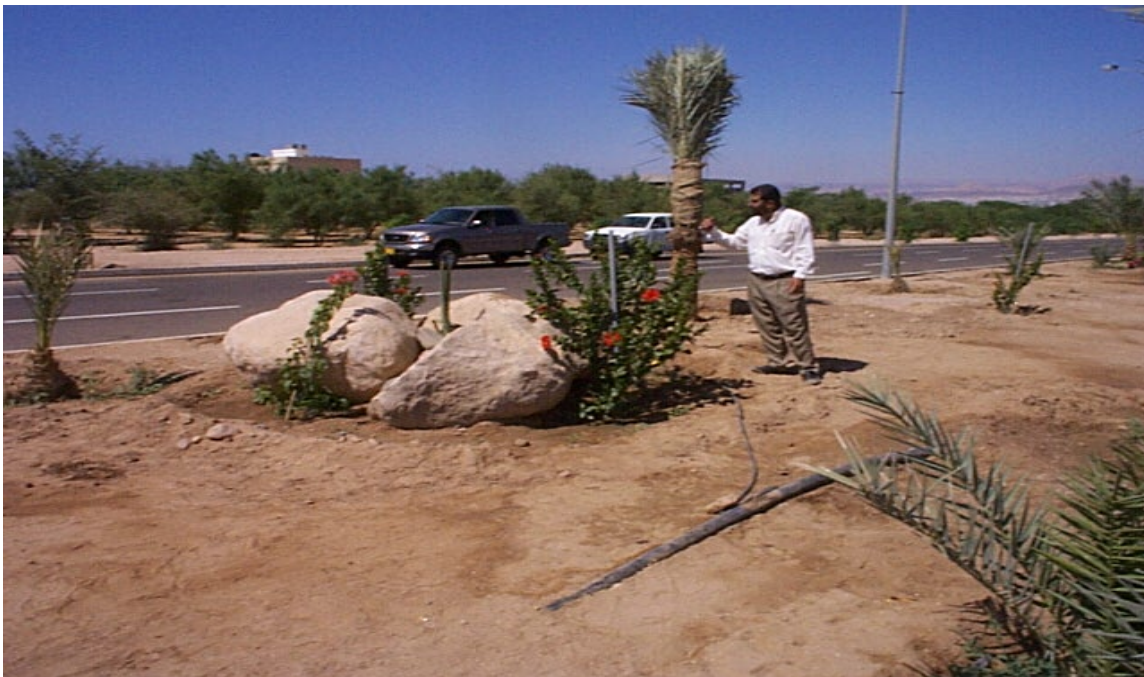
Figure 9. Center median along Farouq Shrer.