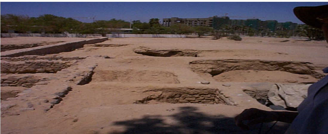
Figure 19. Demonstration site with view south along wall.