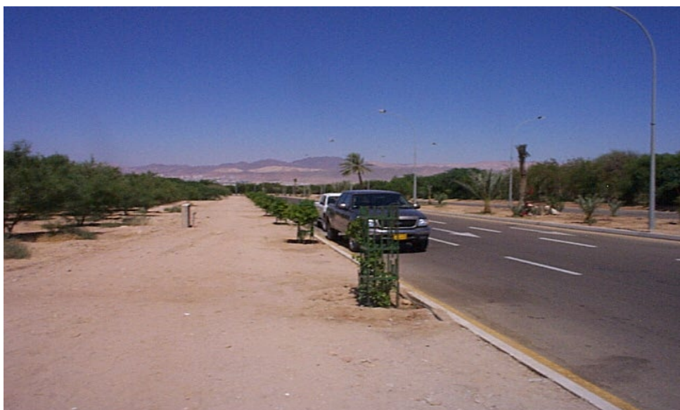
Figure 7. Southern side of Farouq Shrer Street with drip line surfacing within wells.

The Farouq Shrer (Farouq Street) has several types of plantings along the medians. This street is on the outer edge of the community, but within the city limits on the north side of town near the wastewater treatment plant. New plantings are irrigated by hand with hoses although there are drip lines running along the southern side of the street (Figure 7). The irrigation is utilizing the wastewater from the old wastewater treatment plant. This is a very low-quality water and does not meet minimal acceptable standards for irrigation.