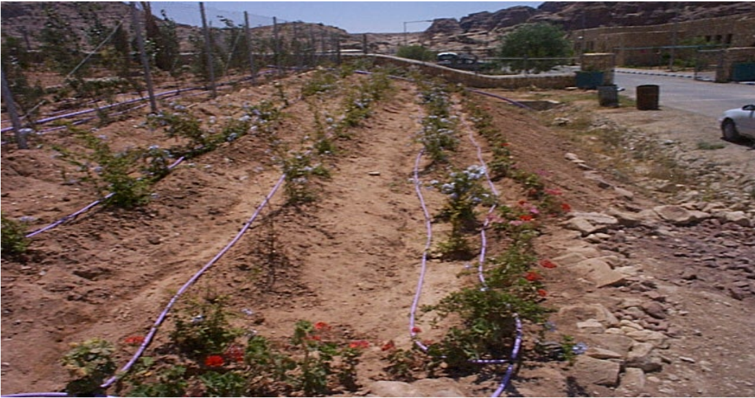
Figure 30. Landscape plants at Wadi Mousa demonstration site.