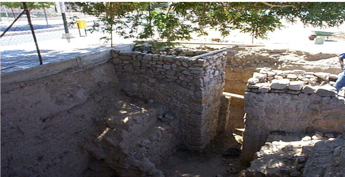
Figure 18. Archeological excavation along the road north of the property.