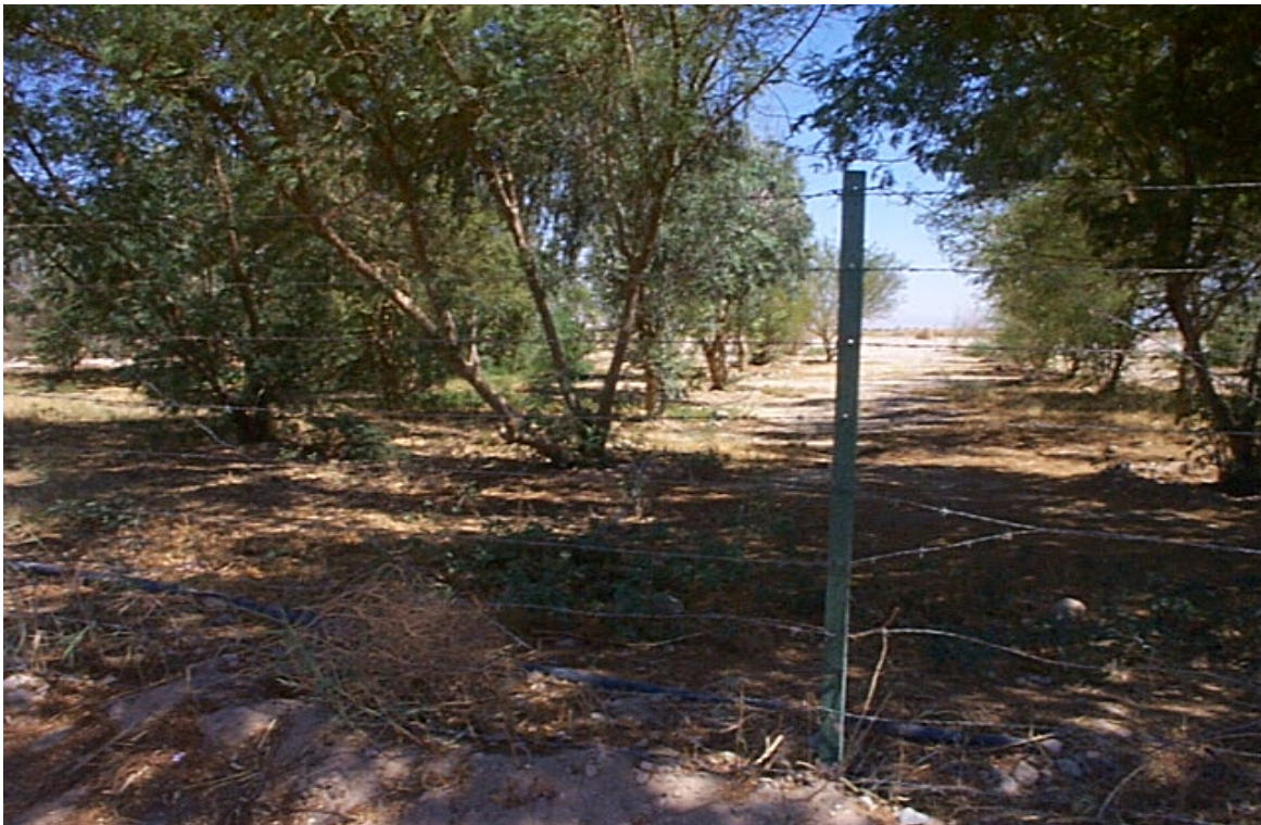
Figure 10. Plants along north side of Farouq Shrer.

The wastewater reuse site is near the wastewater treatment plant and Farouq Shrer on the north side of town (Figure 11). Currently, the wastewater reuse site is undeveloped. The site is 100 dunnams (10 ha), and PA Consulting plans to put 1/3 of the site in a landscape plant nursery, 1/3 in fodder, and 1/3 in fruit trees. A view of the wastewater reuse site looking northwest is shown in Figure 12.