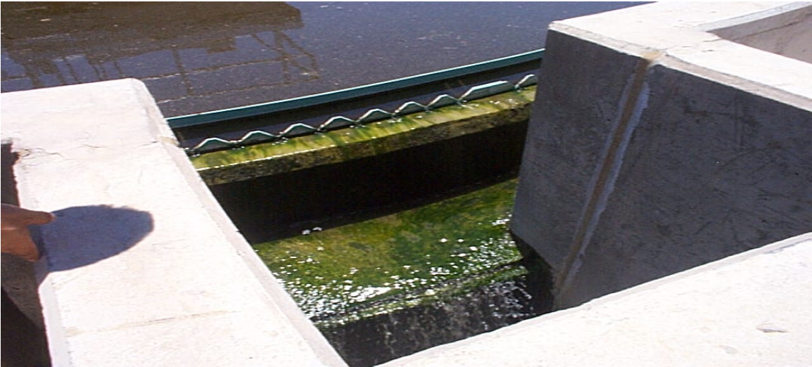
Figure 25. Effluent discharged from final clarifiers.