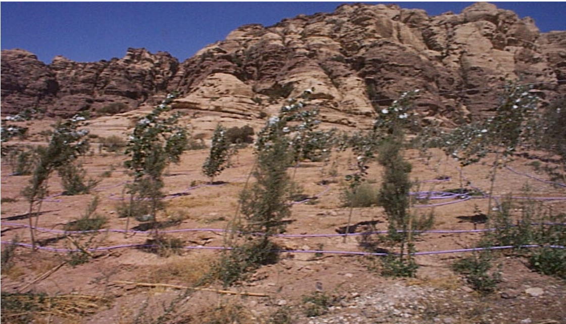
Figure 31. Landscape plants at Wadi Mousa demonstration site.