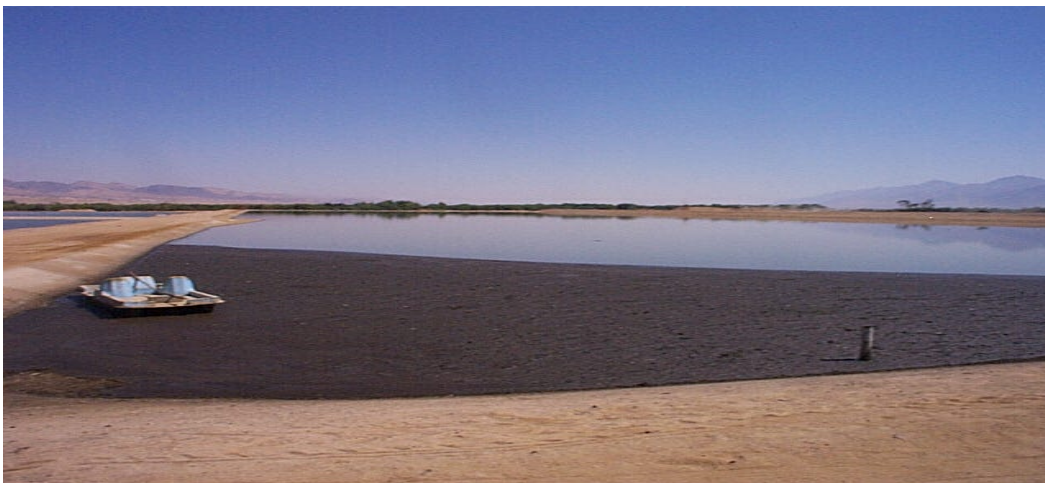
Figure 13. Facultative pond in Aqaba.

The wastewater treatment plant is a completely passive system with two facultative ponds (Figure 13) and two maturation ponds in parallel (Figure 14). Both ponds are 9 m deep. There is a 17-day design detention time; however, the ponds are currently overloaded. The flow rate into the wastewater treatment plant is 9,000 m 3 /day. The loss to seepage and ET is 1,500 m 3 /day. Approximately 1/3 of the wastewater irrigates a date palm farm. The farm treats the wastewater before application to the palm trees.