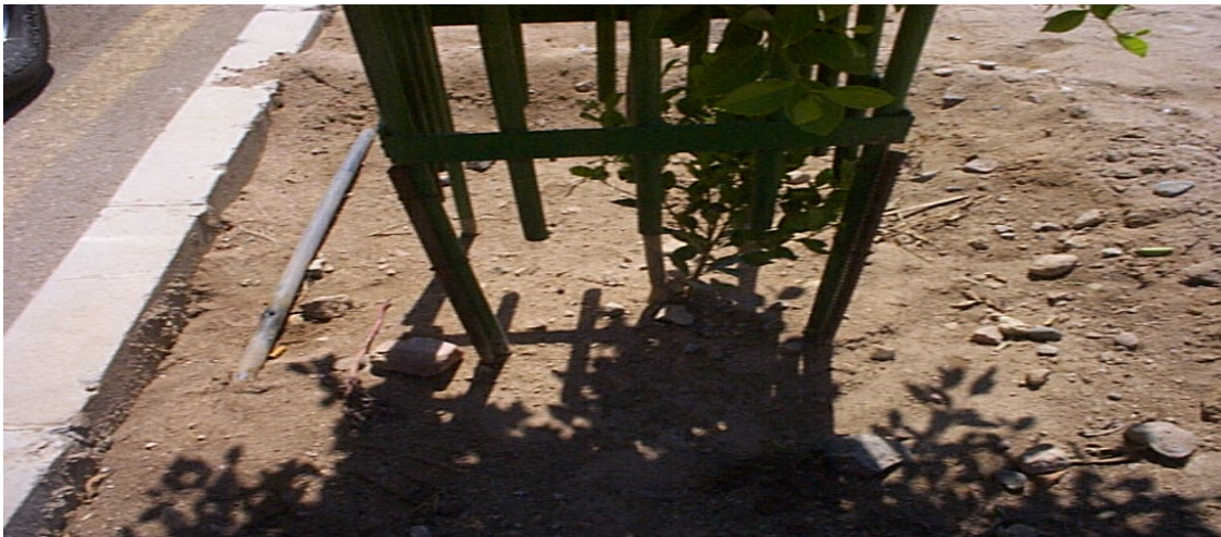
Figure 8. Tubing with missing emitter.

On the north side of the street, trees were arranged in rows four deep and were irrigated by hoses also that were attached to a polyethylene line. This planting was much more mature (Figure 10).