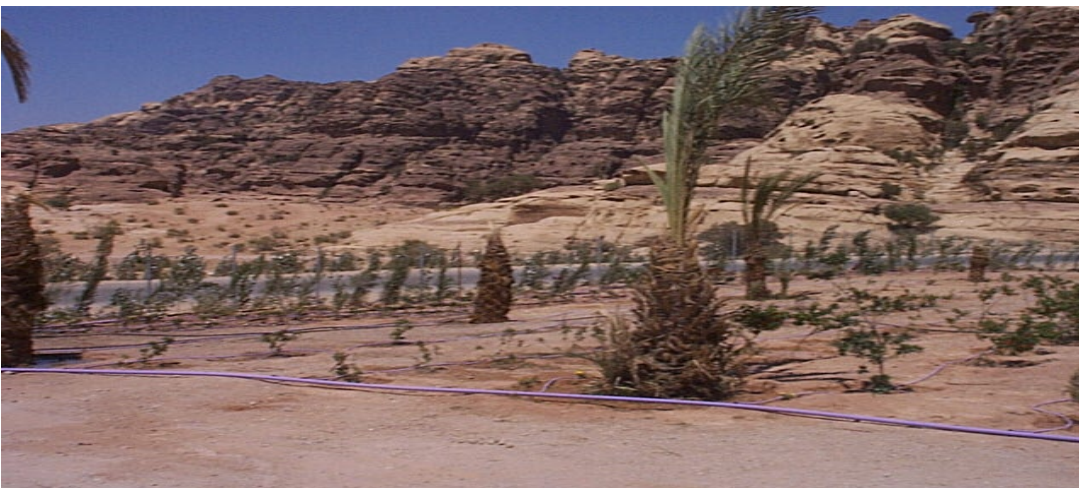
Figure 29. Landscape plants at Wadi Mousa demonstration site.

We toured the demonstration gardens and there were mixed results. Landscape plants and trees appeared to be doing Ok (Figure 29-31), and they were all being watered by hand. Agronomic crops such as sunflowers, alfalfa, and corn were not doing as well. The drip irrigation system is not in use yet so they are being watered with hoses. There is some difficulty in getting the manual laborers to be responsible to water the plants consistently. PA Consulting specified that they wanted to use purple tubing (Figure 32) because of the use of reclaimed wastewater. They tried to work with one manufacturer, but that company could not get the purple dye into the polyethylene. Another manufacturer was able to include the purple dye. The tubing felt very thin and is probably not designed to last beyond one or two years. Another problem with the irrigation system was the fact that the contractor installed the pump on pallets rather than concrete and wiring was done incorrectly.