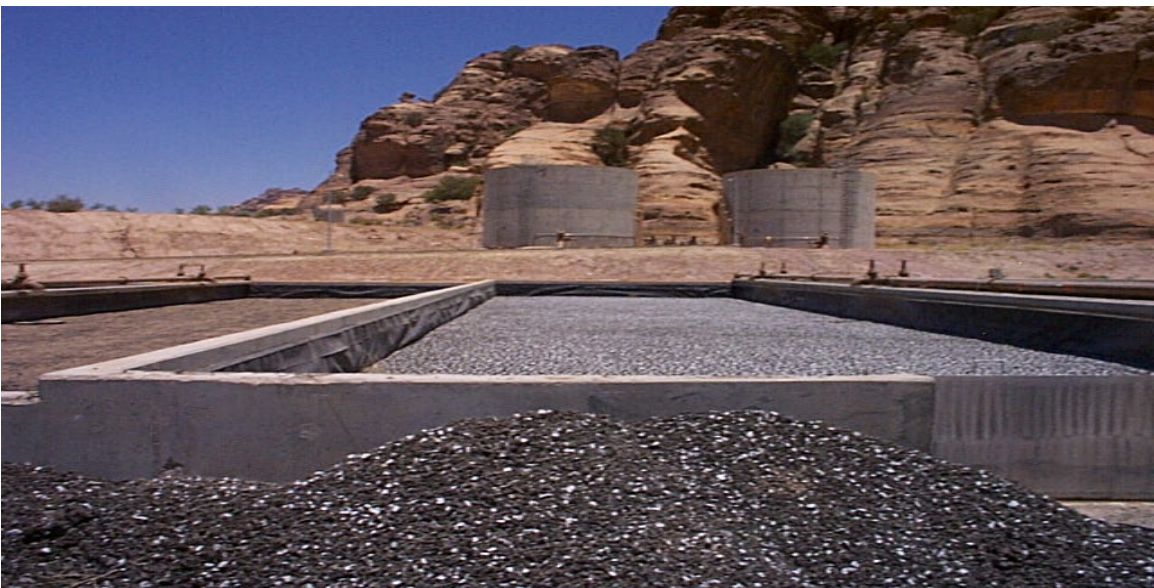
Figure 26. Drying beds and bio-solids at Wadi Mousa wastewater treatment plant.