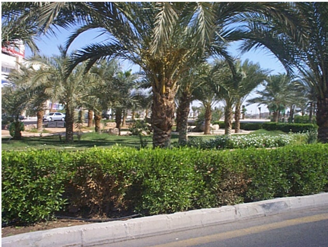
Figure 6. Turning circle with palms hedges and sprinklers.

The Farouq Shrer (Farouq Street) has several types of plantings along the medians. This street is on the outer edge of the community, but within the city limits on the north side of town near the wastewater treatment plant. New plantings are irrigated by hand with hoses although there are drip lines running along the southern side of the street (Figure 7). The irrigation is utilizing the wastewater from the old wastewater treatment plant. This is a very low-quality water and does not meet minimal acceptable standards for irrigation.