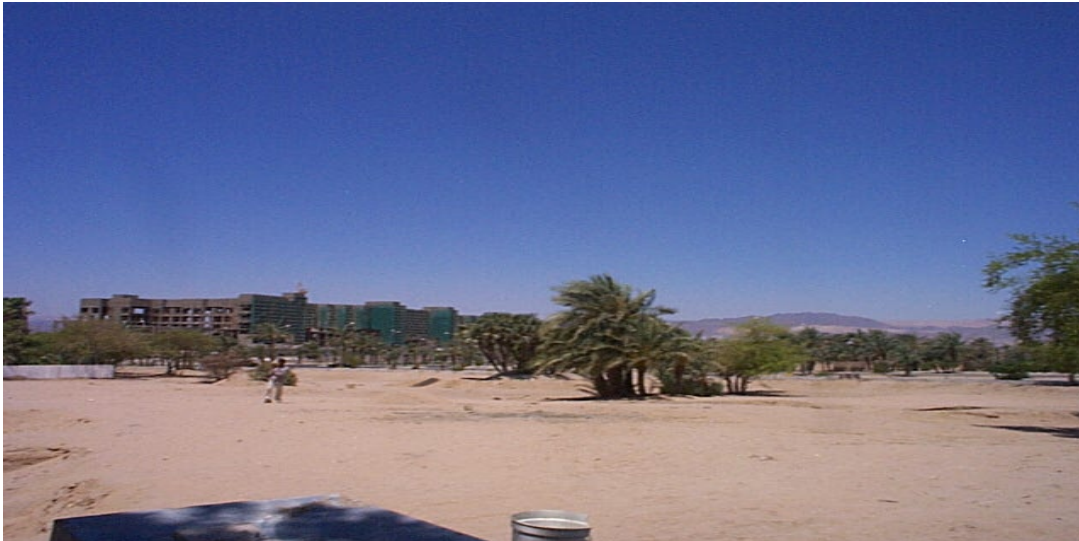
Figure 22. A view of the demonstration garden looking southwest.

A slide show was presented to Bilal Bashir and others from ASEZA (10 people) at the Marina. I discussed the need for irrigation efficiency. There is a lack of irrigation efficiency and uniformity in most landscape irrigations systems in general, and I used my study of landscape irrigation systems in Phoenix as an example. I mentioned the critical need for irrigation efficiency in Aqaba because the ground water flows directly into the gulf of Aqaba where a nutrient excess threatens the coral. I discussed the need for water conservation officers in Aqaba and of the possibility of giving the officers some legal authority. I stated that I would like to see bubblers and in-line drip emitters incorporated into the demonstration garden. Also the possibility of linking the demonstration garden in Aqaba to the Desert Irrigation Research and Training Center in Tucson was approached. The slide show given in Aqaba is included as appendix A. Because of the danger of wastewater treatment inconsistencies, I emphasized that the wastewater should not be used for vegetable production (I mentioned this somewhere, maybe not here, but they agreed and decided that they would emphasize that people shouldn't grow vegetables, but they would have to leave it up to the citizens to make their own decisions).