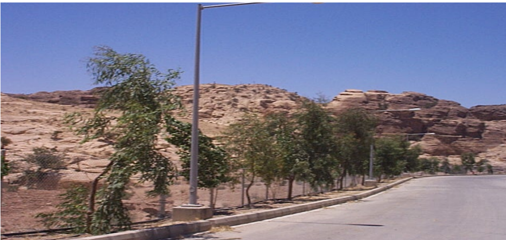
Figure 27. Trees fertilized with bio-solids after one year.