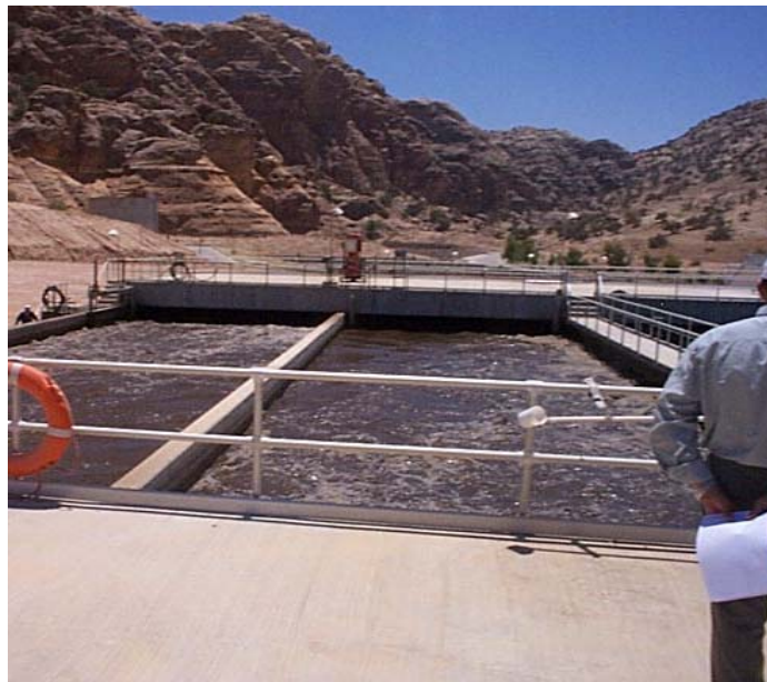
Figure 24. Activated sludge system at Wadi Mousa wastewater treatment plant.