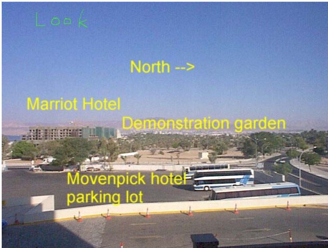
Figure 16. View of the demonstration garden from the Movenpick hotel.

The demonstration site soil is a type of sand. There appears to be very few rocks, and it would seem to be easy to trench or dig. Much of Aqaba has similar soil. One advantage of the sand is that many low water use plants require good drainage, and this site would certainly have good drainage. A view of the demonstration site from the northwest side looking southeast is shown in Figure 17. The large hole is an archeological pit where nothing was found.