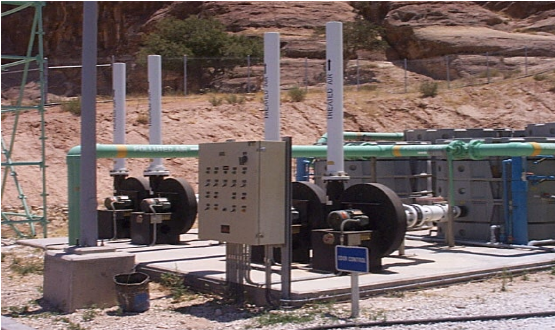
Figure 23. Odor control system at Wadi Mousa wastewater treatment plant.