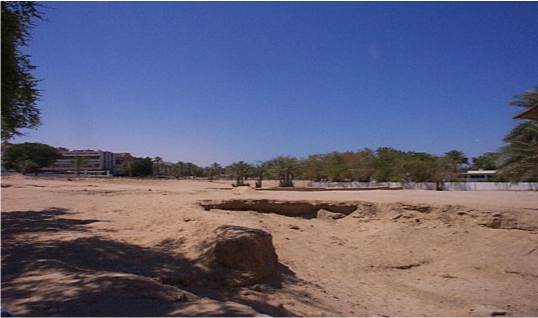
Figure 17. Demonstration site in Aqaba with archeological pit.