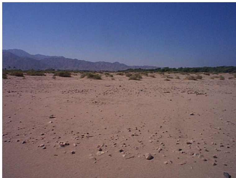
Figure 11. Wastewater reuse site in Aqaba looking southeast.

The wastewater reuse site is near the wastewater treatment plant and Farouq Shrer on the north side of town (Figure 11). Currently, the wastewater reuse site is undeveloped. The site is 100 dunnams (10 ha), and PA Consulting plans to put 1/3 of the site in a landscape plant nursery, 1/3 in fodder, and 1/3 in fruit trees. A view of the wastewater reuse site looking northwest is shown in Figure 12.