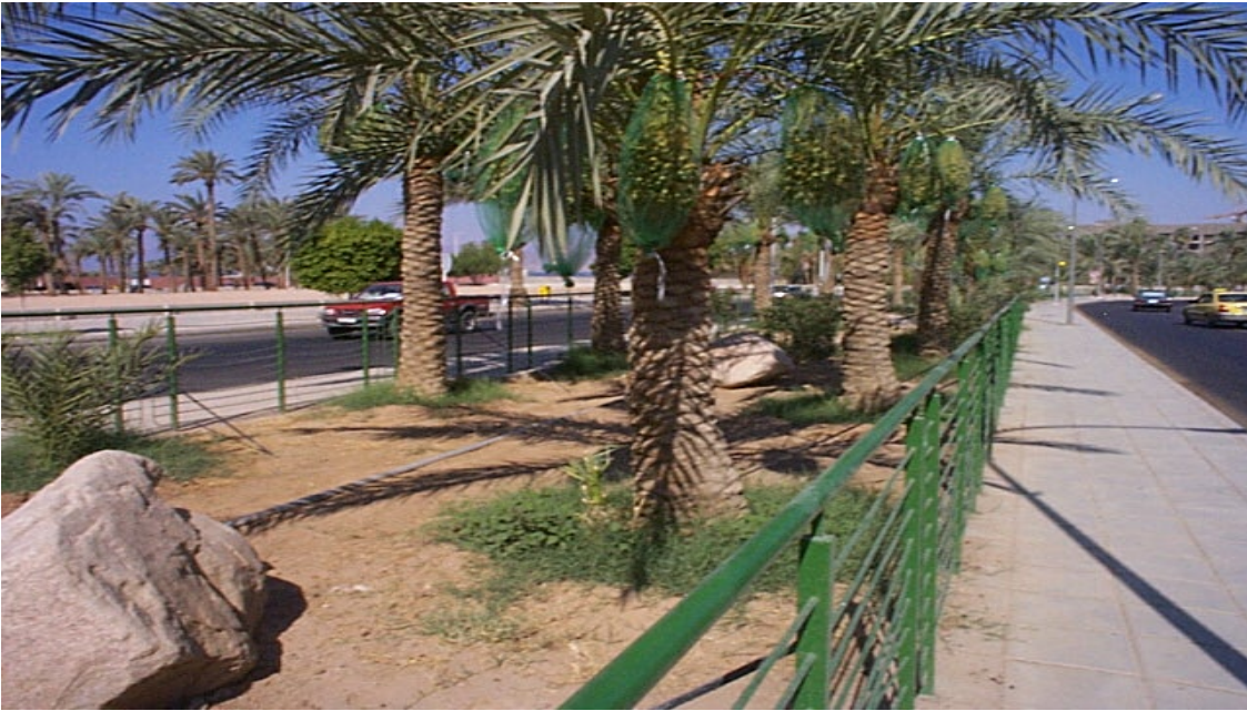
Figure 4. Water supply line along the median.