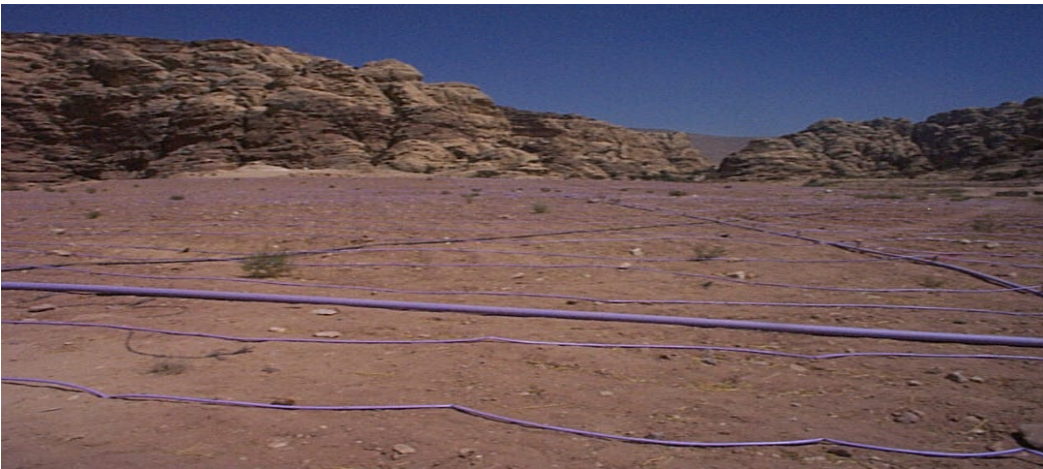
Figure 33. Drip irrigation system at unplanted ground at Wadi Mousa.

We met with PA Consulting and discussed the issue of the demonstration garden around the visitor's center and that Margaret Livingston, from the U of A, might be able to help with this project. PA Consulting said they only have $20,000 budgeted for the visitor's center and, consequently will have to be a simple design. They will start building the center in September because they need to complete their contract. There was some discussion because the Badia feels the visitor's center should be more extensive. I think the visitor's center is in the right location; however, more money than what is budgeted will probably be needed to make it an effective outreach tool. Most of the landscape plants are already planted so a minimal amount of work will be needed by Margaret Livingston at this site.