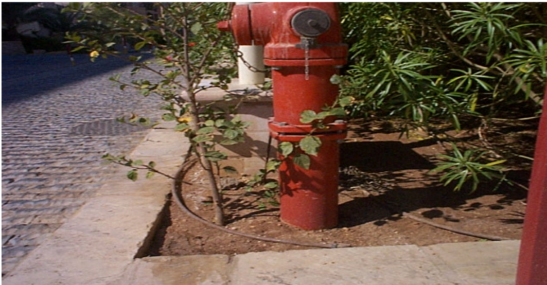
Figure 1. Tubing wrapped around fire hydrant.

Hose irrigation is used to water the medians and parks in Aqaba. Even in a new park with a drip irrigation system, the maintenance personnel leave the drip system off and irrigate with hoses. There are small basins around each plant. Pipes (aluminum and polyethylene) often run along the surface of the medians (Figure 4). Spigots attached to the surface mainlines supply water for hose irrigation. The major plant type in the medians are palms (Figure 5). Turning circles and parks often include palms, turf, and hedges and are irrigated with sprinklers (Figure 6).