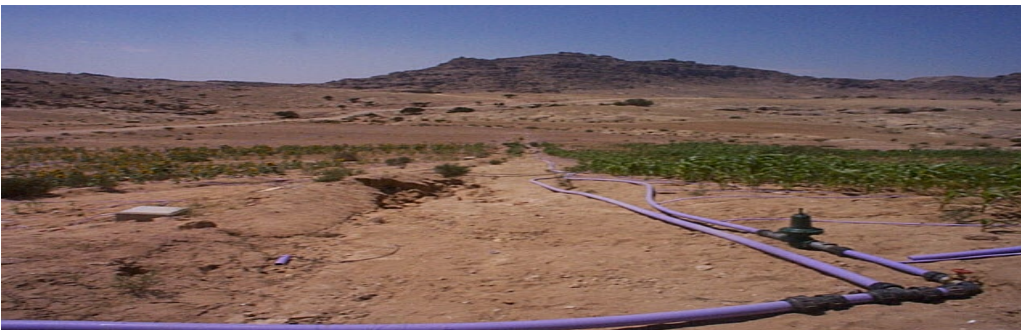
Figure 32. Drip irrigation system with pressure regulator at Wadi Mousa.