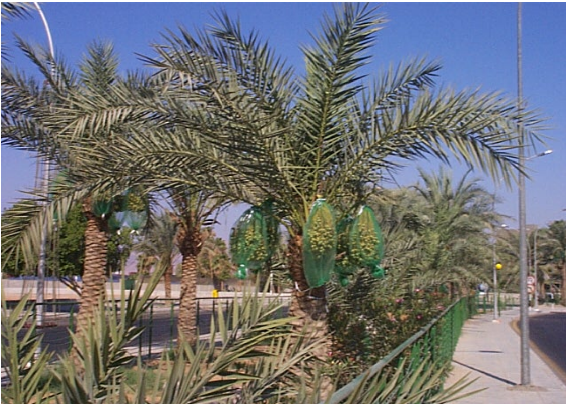
Figure 5. Palms planted along medians.