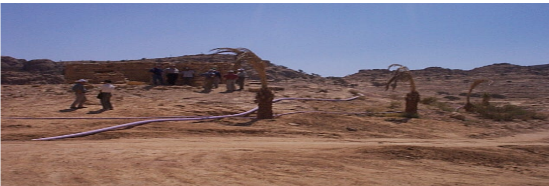
Figure 34. View of the hill where the visitor's center will be located.

The slopes at this site are very steep which makes the design of the drip system difficult. I think that the drip design should be modified to include telescoping pipes in order to reduce the energy due to elevation gain. There was a pressure regulator on the system (Figures 33 and 34), but there should be some method of keeping pressure constant on the slope unless the emitters are pressure compensating, and it is my understanding that they are not. The main lines were above-ground polyethylene (this may be a common practice in Jordan), but I would prefer to see buried mainlines. I recommend approving the design if the system has a distribution uniformity (DU) of 80% while it is running.