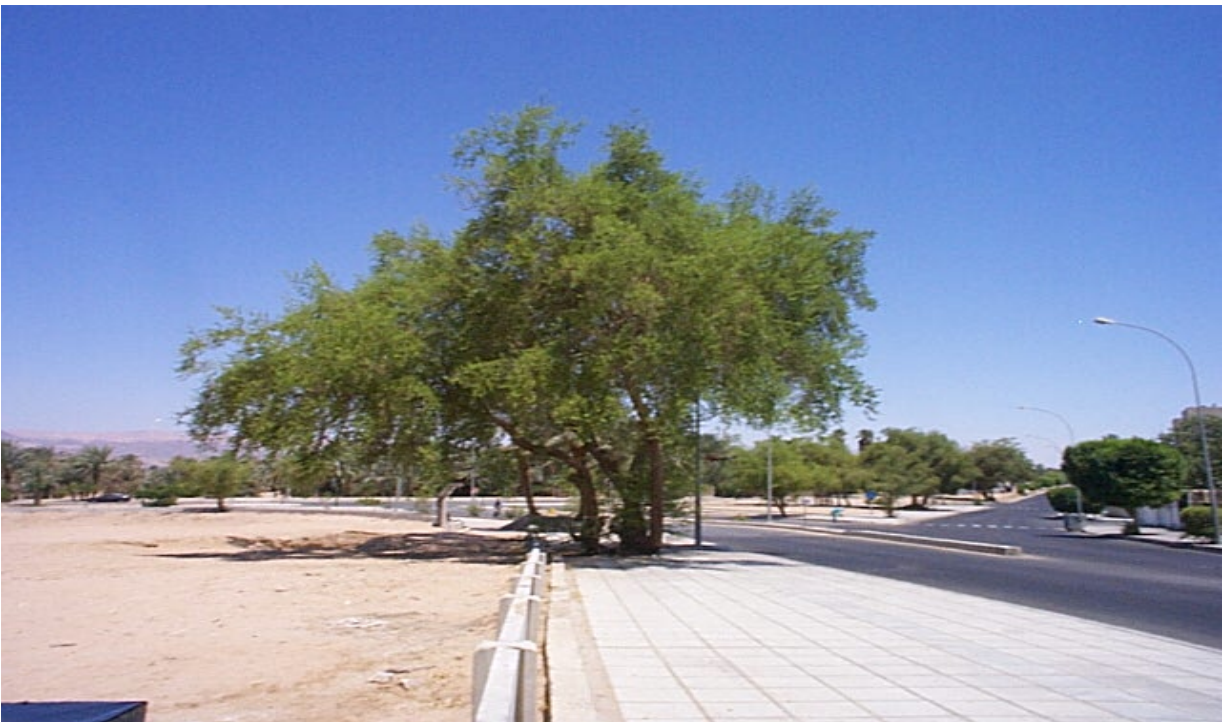
Figure 21. East side of demonstration garden.

I think it is important for Margaret Livingston to contact the people who are in charge of the archeological diggings so that discussions can begin on the best way to integrate the demonstration garden and the digs.