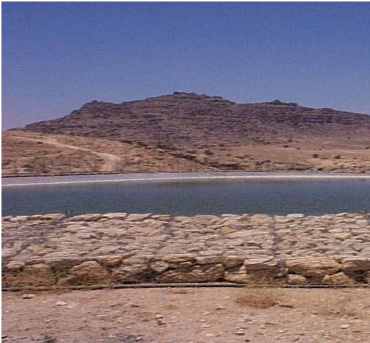
Figure 28. Final stabilization pond at Wadi Mousa

We toured the demonstration gardens and there were mixed results. Landscape plants and trees appeared to be doing Ok (Figure 29-31), and they were all being watered by hand. Agronomic crops such as sunflowers, alfalfa, and corn were not doing as well. The drip irrigation system is not in use yet so they are being watered with hoses. There is some difficulty in getting the manual laborers to be responsible to water the plants consistently. PA Consulting specified that they wanted to use purple tubing (Figure 32) because of the use of reclaimed wastewater. They tried to work with one manufacturer, but that company could not get the purple dye into the polyethylene. Another manufacturer was able to include the purple dye. The tubing felt very thin and is probably not designed to last beyond one or two years. Another problem with the irrigation system was the fact that the contractor installed the pump on pallets rather than concrete and wiring was done incorrectly.