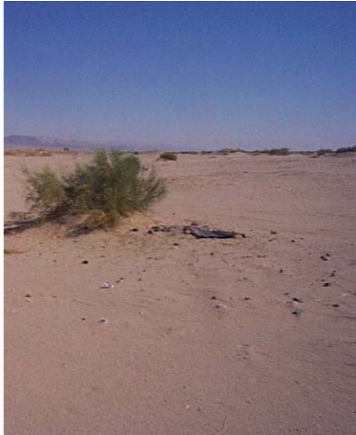
Figure 12. View of the wastewater reuse site looking northwest.

site is 100 dunnums (10 ha), and PA Consulting plans to put 1/3 of the site in a landscape plant nursery, 1/3 in fodder, and 1/3 in fruit trees. A view of the wastewater reuse site looking northwest is shown in Figure 12.