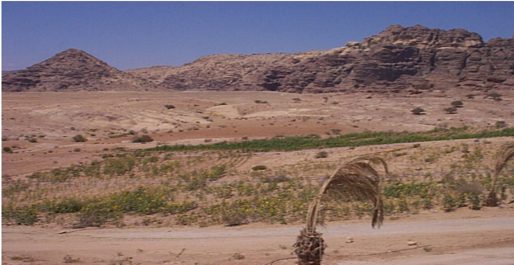
Figure 35. View from the proposed visitor's center.

The proposed visitors center at Wadi Mousa is located on a high point (Figure 34) and looks out over the wastewater treatment plant, the demonstration site, and proposed farms. There is an existing structure (Figure 34) that will be torn down and replaced by a 1,000 square foot structure with two rooms. It seems that a very attractive demonstration garden could be designed on this hill with a wetlands project and other landscape features. The view from the hill is shown in Figure 35 with a view of the demonstration gardens and the proposed farm area in the background.