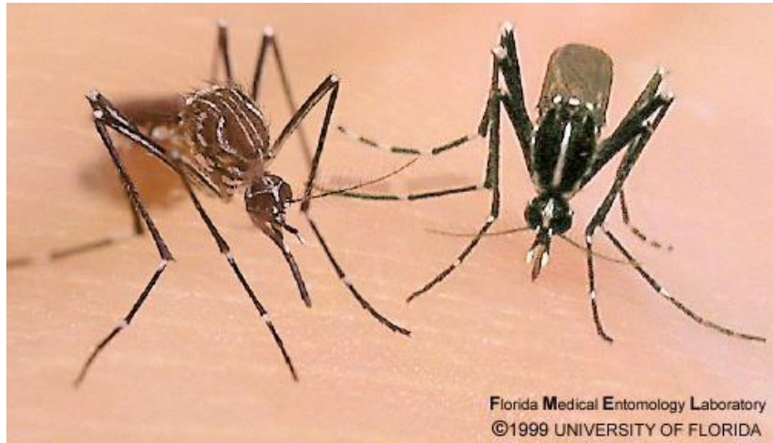
Fig. 4 The yellow fever mosquito Aedes aegypti (left) and Asian tiger mosquito Aedes albopictus (right).

In December 2013 the first cases of locally-acquired chikungunya in the western hemisphere were reported among residents of St. Martin in the Caribbean. The virus quickly began to spread across the Caribbean region, and locally-acquired cases have been reported from North, Central, and South America.