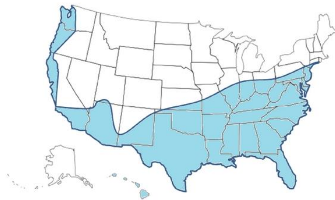
Fig. 3 Map of the U.S. showing the areas at risk of dengue and chikungunya outbreaks.

Currently, there have been confirmed locally-acquired cases of dengue identified in some of the southern states (Florida and Texas). However, many more cases are brought into the United States every year by travelers who contract the virus while abroad. Any state with Aedes aegypti or A. albopictus (Fig. 3) is at risk for local transmission of dengue virus.