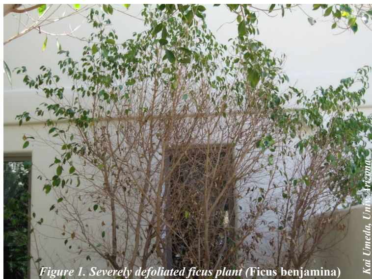
Figure 1. Severely defoliated ficus plant ( Ficus benjamina )

Acknowledgements: Partial support provided via grant from USDA – National Institute of Food & Agriculture's Extension Implementation Program.