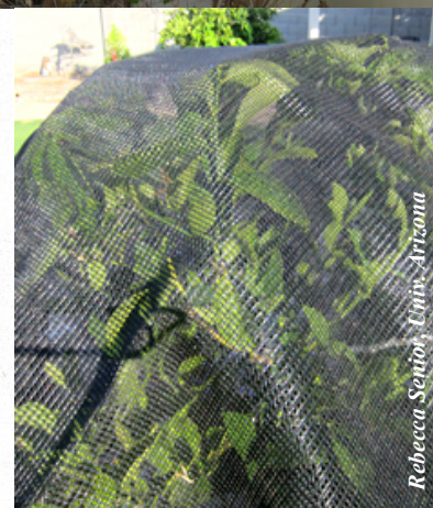
Figure 3. Use of 50% shade cloth to allow adequate sunlight and prevent over-shading