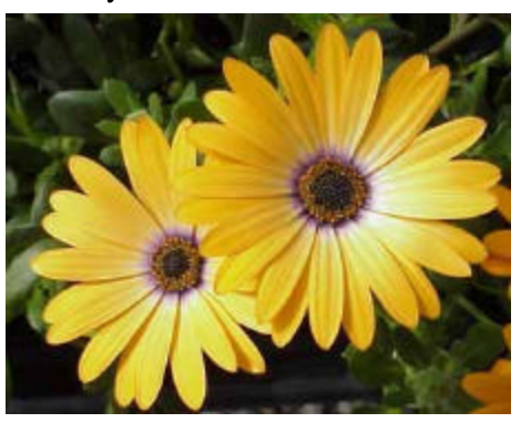
We had a lot of African daisies

this spring and my husband and I collected the seeds and packaged them up to hand out at the tour. Everyone loved getting them, but that is not a requirement for your garden tour. I'll be writing an article about the African Daisies at another time.