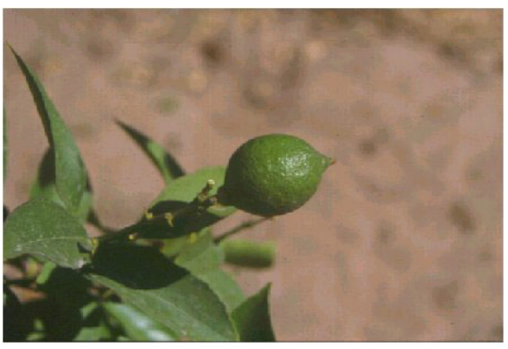
Figure 9. Once the fruit reaches 1 inch in diameter, it is no longer susceptible to significant citrus thrips scarring.

MONITORING: Monitoring citrus for citrus thrips begins at the initiation of bloom, but becomes critical at petal fall (90% blossom drop) in late-March to early-April. On mature trees, sampling should continue until 70 to 90% of the fruit reach a minimal size of 1 inch in diameter. Once the fruit reaches this size it is no longer susceptible to citrus thrips scarring. On immature trees, sampling should continue until mid- to late-October when the fall flush ceases.