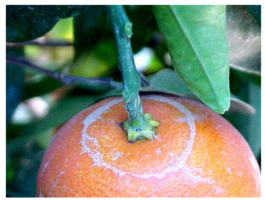
Figure 7. Rind scarring on an orange due to the feeding by citrus thrips beneath the sepal when the fruit was young.

Feeding by citrus thrips on new flush growth will also result in damage to the developing foliage. These leaves will appear distorted and thickened with gray streaks usually parallel to the midvein. Extensive feeding on small leaves and leaf buds can result in significant defoliation and limb "buggy whipping". Fruit bearing trees do not appear to be adversely affected by this damage, but growth may be stunted on non-bearing trees.