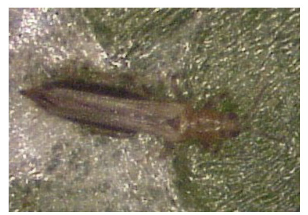
Figure 5. Adult western flower thrips.

Other species of thrips also occur on citrus in Arizona but none of these are of economic importance. These include the western flower thrips, Frankliniella occidentalis, the onion thrips, Thrips tabaci, and Bregmatothrips sonorensis. Of these thrips, the western flower thrips is most common and can be very abundant during bloom, on the flowers, small fruit, and flush growth. Care should be taken to not confuse western flower thrips with citrus thrips. Western flower thrips are more tolerant to insecticides than citrus thrips and when mistakenly identified may give the impression of poor insecticide efficacy.