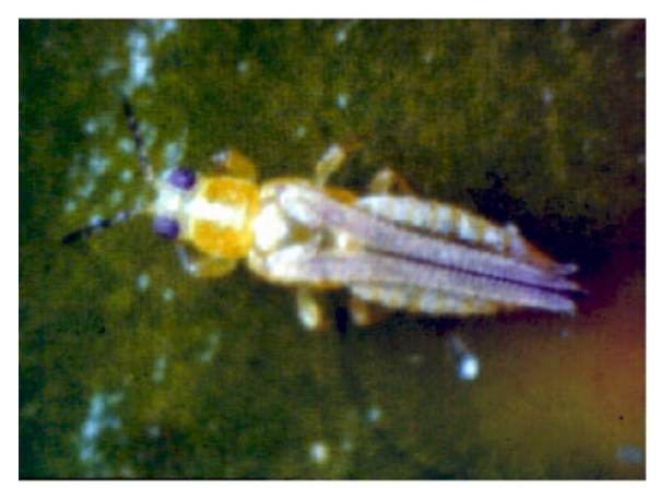
Figure 4. Citrus thrips adult.

Citrus thrips tend to be more numerous on the south side of citrus trees, especially the southeast quadrant. Additionally, they tend to be more numerous between 2 to 3 meters than at other heights.