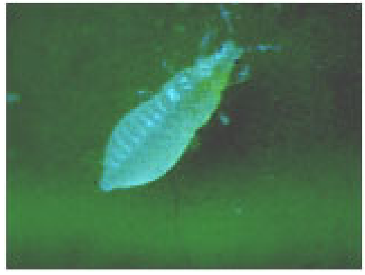
Figure 3. Second instar citrus thrips.

There are two active nymphal stages (first and second instars) requiring 4 to 14 days for development. First instar larvae feed actively on tender leaves and fruit, especially under the sepals of young fruit. The third and fourth instars are pupation stages and do not feed. They complete development on the ground in litter beneath the tree or in the crevices of the tree. The third instar is the prepseudopupal stage and the fourth instar is known as the pseudopupal stage. A single generation may be completed in a period of 15 days. In Yuma, there may be as many as 10 to 12 generations per year, while in Maricopa County they will usually complete 8 to 10 generations per year.