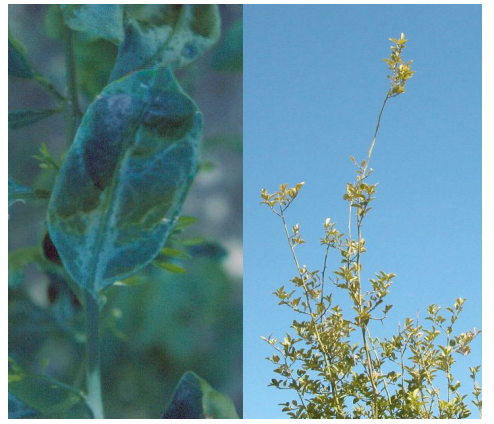
Figure 8. Leaves damage (left) and the "buggy whipping" effect caused by citrus thrips feeding when the leaves were small and subsequent defoliation.

Feeding by citrus thrips on new flush growth will also result in damage to the developing foliage. These leaves will appear distorted and thickened with gray streaks usually parallel to the midvein. Extensive feeding on small leaves and leaf buds can result in significant defoliation and limb "buggy whipping". Fruit bearing trees do not appear to be adversely affected by this damage, but growth may be stunted on non-bearing trees.