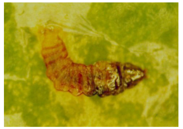
Figure 31. The spinning form of the citrus peelminer larvae cuts out of the mine and pupates in crevasses on the tree or in the ground litter.

color. The spinning form lasts about 1 day and the larvae can reach a length of 4.2 mm.