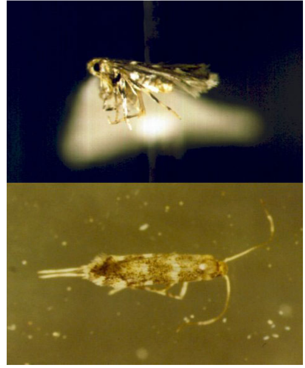
Figure 30. The citrus peelminer is a dark-gray moth about the size of a mosquito.

The adult is a dark-gray moth mottled with brown and cream-colored markings on its wings. The moth is small; about the size of a mosquito (4 mm in length). The moths are active in the morning and early-evening and can live about 11 days. The adult female lays her eggs singly on the fruit surface or on the stems of new flush growth. The number of eggs produced per female may range from 10 to 50 eggs. The eggs are whitish in color, extremely small, oval in shape, convex on top, and with distinct sculpturing. The eggs will hatch in 4 to 5 days.