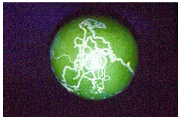
Figure 33. Grapefruit with extensive mining by citrus peelminer.

market. Damage is most severe in late summer and early fall.