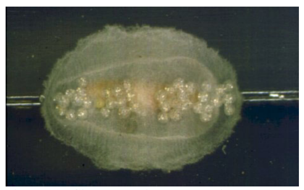
Figure 32. Citrus peelminers pupate in crevasse on the tree or in ground trash.

The spinning larva is a non-feeding stage and will exit the mine, lower itself from the fruit by a silken thread to a secluded niche at the leaf axial, or in a crevasse in the bark, or in ground trash. Pupation takes place in a silken cocoon covered with small, white balls. Peelminer cocoons are rarely observed in the field. Pupation requires 10 to 12 days to complete. The entire life cycle generally takes about 30 days to complete.