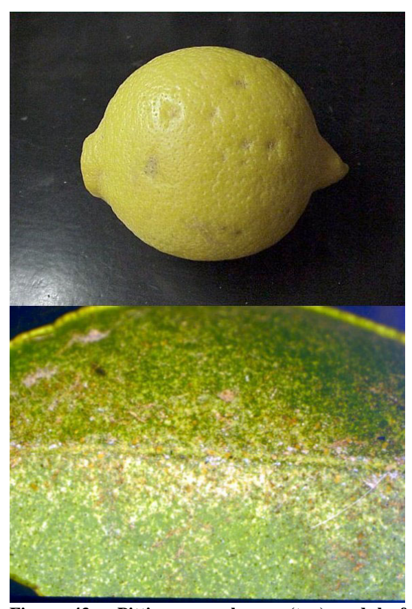
Figure 43. Pitting on a lemon (top) and leaf speckling (bottom) due to Yuma spider mite feeding. Mites prefer to feed on the underside of leaves.

MONITORING: Citrus should be monitored for Yuma spider mite beginning at petal fall though July. Currently there is no action threshold for Yuma spider mite but some general guidelines exist. It is probably not necessary to treat infestation relegated to the foliage unless populations are extremely high. Florida authorities recommend a miticide if spider mite populations reach 15 mites per leaf. Miticides may be necessary to control Yuma spider mites on the fruit when 10% of the fruit less than 1 inch in diameter is infested or when larger fruit averages 3 to 5 mites per fruit.