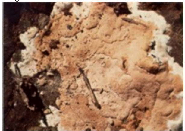
Figure 2. A typical spore mat of Phymatotrichopsis omnivora . These fungal structures occur on the soil surface during the summer "monsoon" season.

During the summer rainy season, the fungus may occasionally produce a white to light tan spore mat on the surface of the soil near the host (Figure 2). Fresh spore mats look like pancake batter on the soil surface. The spores produced in these mats are not considered important in the disease cycle since they have never been observed to germinate. Spore mats are not common and may be confused with other fungi that grow over the soil surface or in decaying litter so they should be positively identified before using them in a diagnosis.