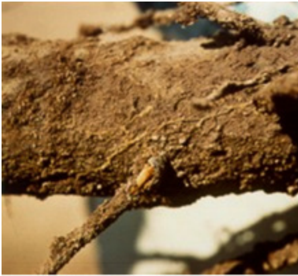
Figure 3b. Strands of Phymatotrichopsis omnivora growing on the surface of an infected root.

planting. Spread occurs in later years by strand growth from infected to healthy root tissue. Eventually, an entire group of plants may succumb to the disease.