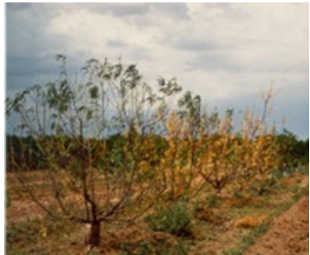
Figure 1a. Symptoms of cotton root rot of peach trees. Note the dead trees with attached foliage.

Most woody trees and shrubs show no symptoms during the first few years after planting into infested areas. This is in contrast with certain tap rooted crop plants such as cotton and alfalfa that become infected and die the first summer after planting. The fungus is deep seated in the soil, and it may simply be that roots of many susceptible plants do not grow into the deeper, infested areas for a number of years.