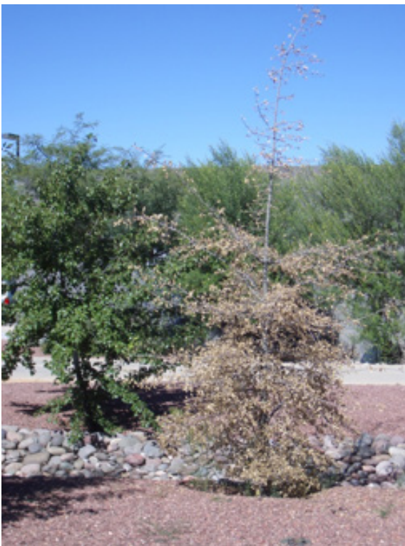
Figure 1c. Symptoms of cotton root rot of Heritage oak. Note healthy oak nearby.