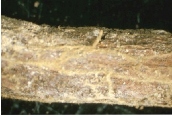
Figure 3a. Young, light brown strands of Phymatotrichopsis omnivora growing on the surface of an infected root.