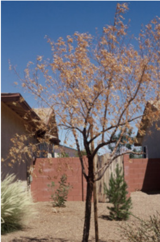
Figure 1b. Symptoms of cotton root rot in African sumac. Note living young Aleppo pine (very tolerant) and fountain grass (immune) nearby.

In grapes, for example, symptoms usually first appear two to four years after planting. Some trees show no symptoms for five or more years after planting. Symptom development and fungal activity is different in plantings in low elevations in Arizona as compared to plantings above 3,600 feet. Symptoms at low elevations consist primarily of initial stress, wilting of foliage and death of the entire plant within a few days after initial symptoms. This death usually occurs from late May through September. At higher elevations, plants may not wilt suddenly, but die more slowly.