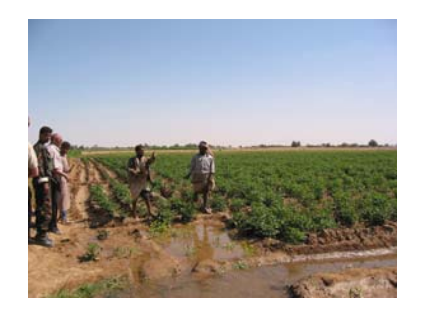
Improved Water Use Efficiency

Intensive in-country training in project management, agribusiness development, and other related fields. Assistance in the development and implementation of applied research, extension, and outreach projects. Support in academic curriculum development. Graduate-level training of faculty members in the U.S. Informational visits of senior faculty and academic administrators to U.S. universities.