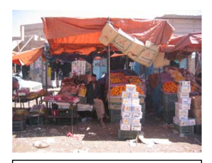
Enhanced Marketing System