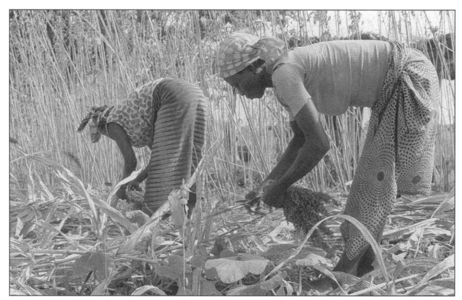
Figure 3. Folk varieties are often selected for intercropping. Kusasi farmers harvesting long-season sorghum in northeast Ghana. Earlier the same field produced a harvest of short-season pearl millet.

Stability at regional and national levels can be influenced by the degree of diversity in environments and input sources. In modern industrial agriculture a relatively small number of crop varieties are usually developed for production over a large area of relatively more uniform environments and are often dependent on purchased inputs and an energy- and capital-intensive infrastructure to deliver these inputs, in order to produce high yields. Folk varieties are usually not dependent on such inputs or infrastructure. When there is an interruption in input supply (e.g., lack of irrigation water or lack of fuel for vehicles delivering agrochemicals) due to resource shortages, drought, social conflict, or other factors, modern varieties characteristically show a reduction in yield that is greater and covers wider areas, compared with folk varieties. Therefore, because of increasing homogeneity of plants, cropping practices, and input supply sources over large geographical areas, the extent to which yields in different regions and nations vary in synchrony both within and between years may increase with the introduction of modern varieties and the industrialization of agriculture (Anderson and Hazell 1989, Barker et al. 1981).