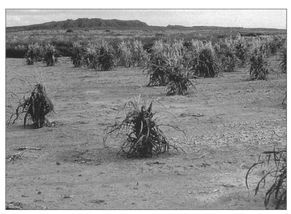
Figure 1. Folk varieties are often adapted to difficult, local growing environments. Hopi blue maize is adapted to growing in an arid area with a short growing season.

Sustainability is a key concept in agricultural development today. Defining sustainable agriculture is not a scientific process but rather an exercise in reaching consensus on values (Cleveland 1993). However, once a definition is agreed on, empirical data can be used to measure sustainability in a given system. Most definitions to date include conservation of natural resources