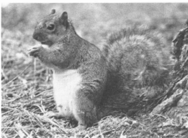
FIG. 1. Sciurus niger from Eugene, Lane Co., Oregon.

DISTRIBUTION. Sciurus niger is found in much of the eastern and central United States extending northward into the