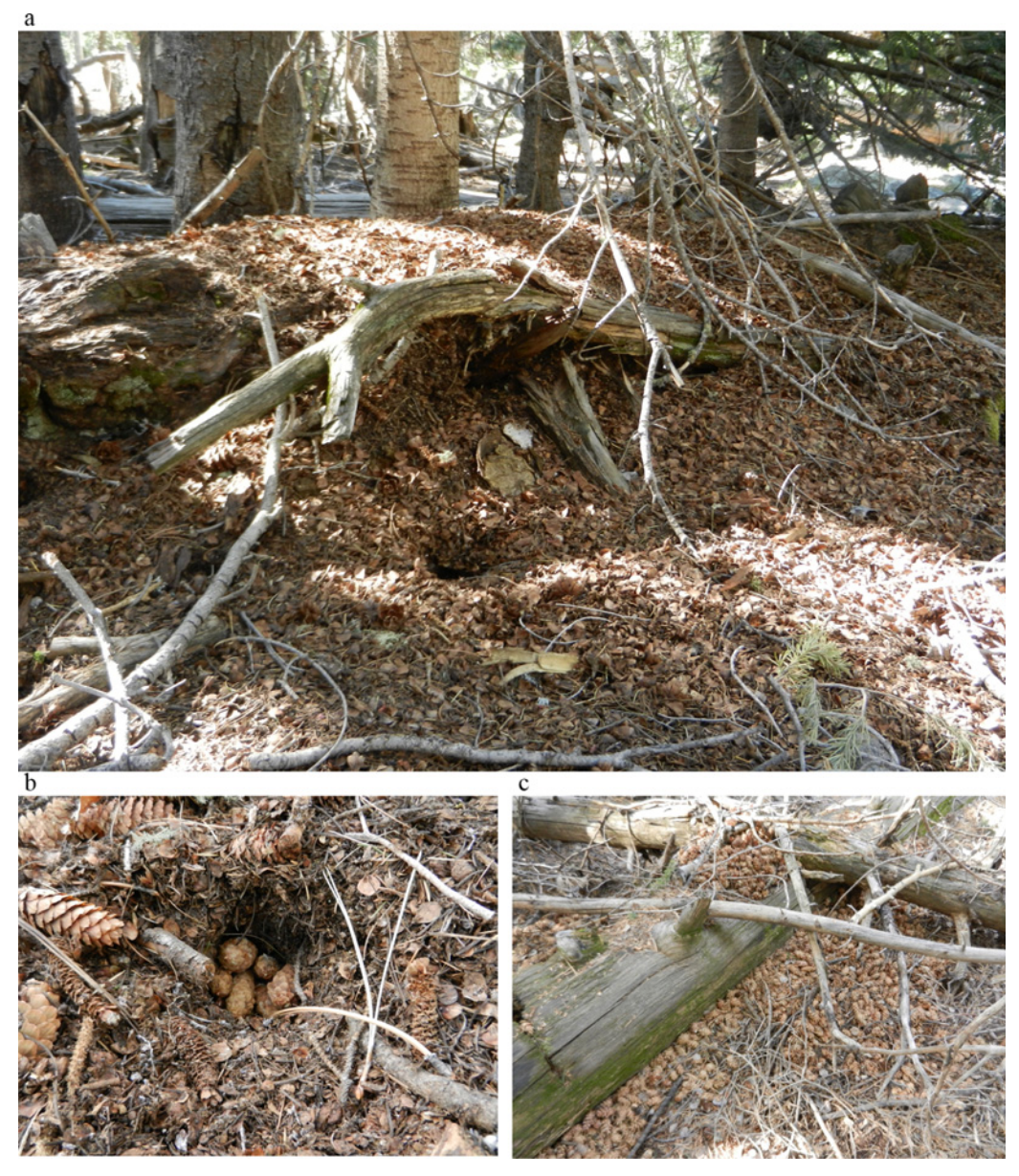
Fig 1. Red squirrel ( Tamiasciurus hudsonicus ) midden. Photographs of (a) red squirrel ( Tamiasciurus hudsonicus ) midden cone-scale pile, (b) cached cones inside pit excavated by red squirrel, and (c) stored cones, which may number in the thousands at a single midden. Mt. Graham, Graham Co. Arizona, 2011–2012.